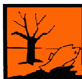
N Dangerous to the Environment