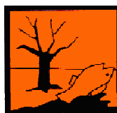
N Dangerous to the Environment